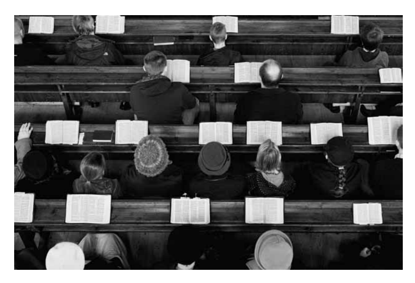
Prayer Meeting in the Church of Scotland, Leurbost.

"I wish you to have this," he said, passing her a pound note. "The Lord directed me to give it to you."