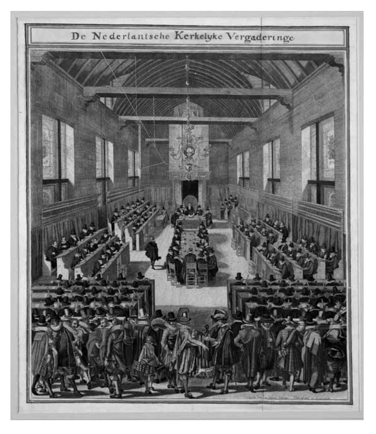
The Synod of Dort, Netherlands, 1618–19. Watercolour by Gerard van Hove.

Little of it would be of wider interest were it not that the causes that provoked the Reformation, and its subsequent consequences, have historically played out so big in the political development of former Dutch and British colonies such as Indonesia, the United States, and as we shall see in a redemptive example later, the Republic of South Africa.<sup>37</sup>