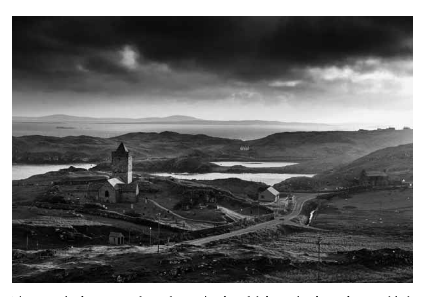
The Sound of Harris and St Clement's of Rodel from the foot of Roineabhal.

We behaved well under his stern Puritans, and must have picked up some good habits from them. We still retain a grim Calvinism, and a main shopping boulevard, called after the stern Protector.