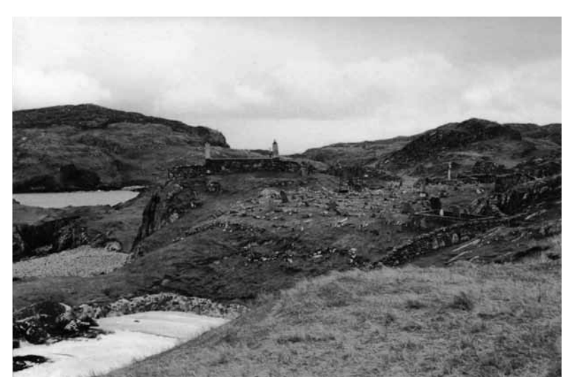
Site and cemetery of Teampall Mhicheil , the "Temple" or Church of St Michael on Little Bernera (the prominent building is a late addition). By adding sand to the thin soil those newly passed away were laid to rest amongst their ancestors, forming a hill or community of the dead. Author's photo, 1995.

Such teampallan or "temples" – I take it, as does Anglicised local custom, directly from the Gaelic to designate these mainly pre-Reformation chapelsites – have only recently been the subject of a relatively comprehensive archaeological survey (Barrowman, forthcoming). One can but speculate that they may have been repositories for icons, holy books, communion chalices, a burning candle or other devotional aids