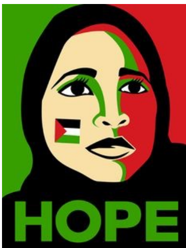
The Palestine Poster Project Archives. © 2009–2013 Liberation Graphics Artist: Granate Sosnoff, 2009