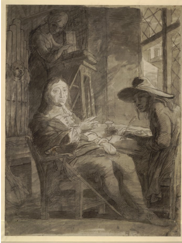
John Milton & Thomas Ellwood Sketch by James Barry, a friend of William Blake—in the collection of the British Museum.