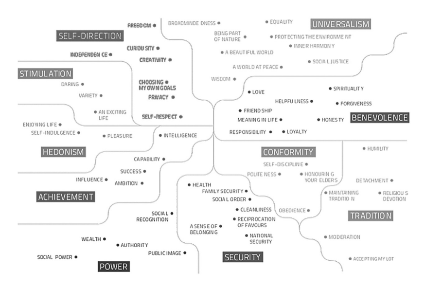
Figure 2. This diagram shows ten common human values.<sup>45</sup>

Imagine the needs and interests of those you wish to influence. It will be helpful to speak their language. What will engage them is often very different from what you find compelling. Consider Figure 2. Research by Shalom Schwartz and others, done in 82 countries, suggests that there are common human values.<sup>44</sup> All of us are motivated by these different values but will focus on some more than others. You may focus on benevolence and universalism, but the people you're in dialogue with may focus other values—power and tradition, for example. If you speak only about values that they place less importance on, you will struggle to understand each other or to address worries they may have about your request. So try to identify what values are most important to each audience you're communicating with.